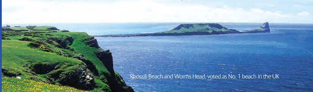
Rhossili Beach and Worms Head, voted as No. 1 beach in the UK

We have carefully selected six quality golf courses and two outstanding hotels for your enjoyment and pleasure. The Gower peninsula is Britain's first area of outstanding natural beauty. You will discover beautiful golf courses, stunning beaches and spectacular walks. All this at very affordable prices. We look forward to seeing you.